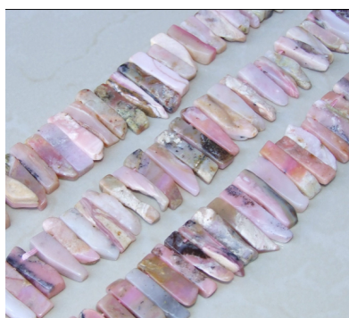
20 Peruvian Pink Opal Slices