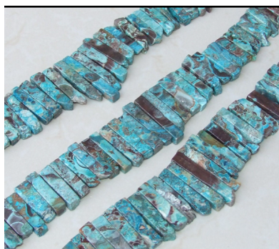
21 Ocean Jasper Slices