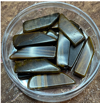
4 Tiger Eye Slices