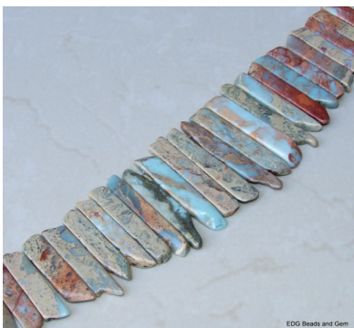
17 African Opal Slices