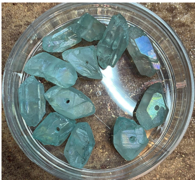
12 Light Blue Aura Quartz