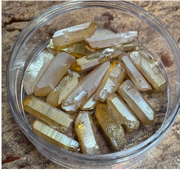
10 Light Orange Titanium Quartz