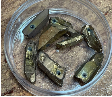
6 Copper Titanium Quartz