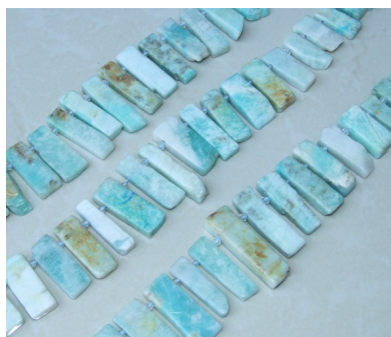
19 Amazonite Slices