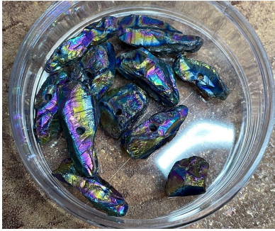
14 Titanium Aura Quartz