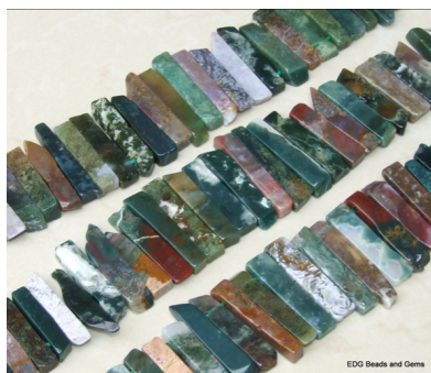
18 India Agate Slices