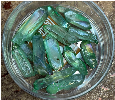
11 Light Green Aura Quartz