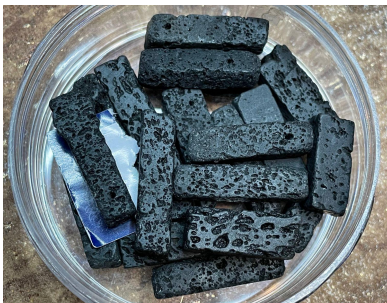
13 Lava Slices