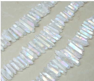
16 Titanium Aura Quartz