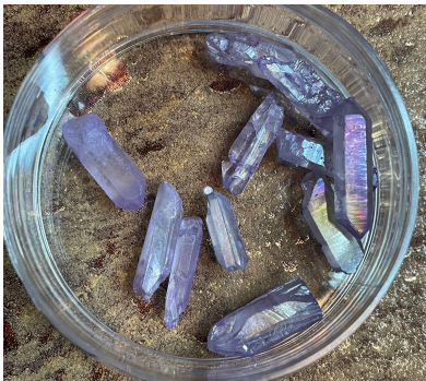
8 Lavender Aura Quartz