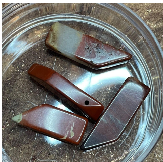
5 Red Jasper Slices