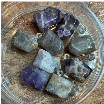
9 Amethyst cubes