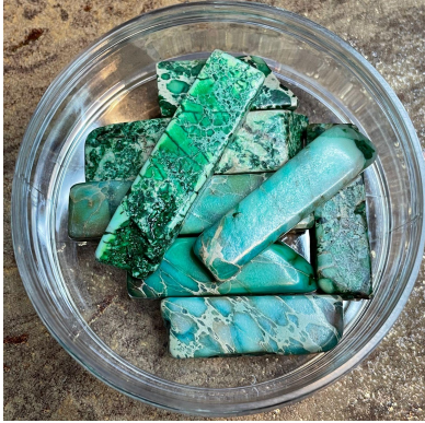
2 Dyed Imperial Jasper Slices