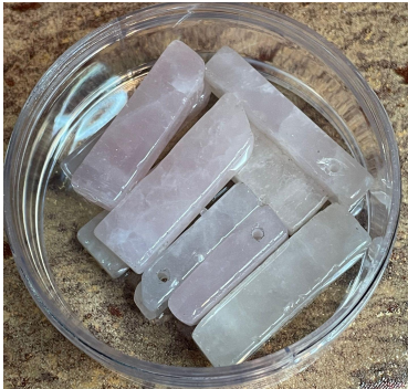
7 Rose Quartz Slices