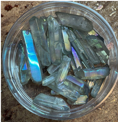
3 Aura Quartz