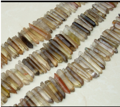
15 Smokey Quartz